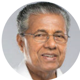
PINARAYI VIJAYAN Chief Minister Government of Kerala

INTERNATIONAL CONFERENCE AND CONSULTATION KERALA STATE PLANNING BOARD